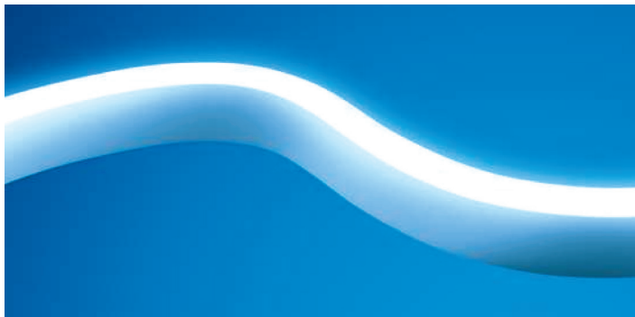
Curve Linear size 21 x 11.5 mm with 11.5 mm illuminated side

Atecpool LED Linear Lighting Curve Linear, 21 x 11.5 mm, is a high quality, flexible LED strip, with a 11.5 mm illuminated side. Current regulator via integrated circuit. Generated heat is dissipated due to thermally conductive coating. Fully waterproof IP68 end connection for strip LED by molded Injection connector with a unique co-extrusion technology. Lead-free, RoHS compliant.