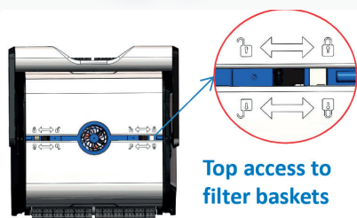
Top access to filter baskets