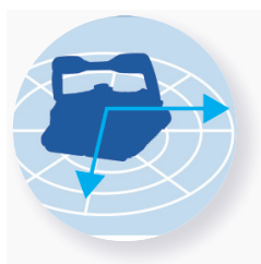
3D gyroscope navigation